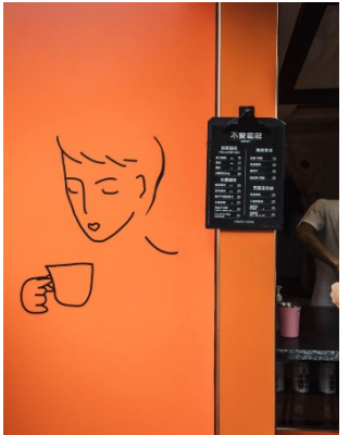
Fig 9. Celebrity shops mainly focus on decoration side

The chase of aesthetic sense seems lead to another excessive end. The space's functions are further weakening in the users' eyes. During the design period, the owners focus on building several corners that are good for taking photos; when the store is ready to use, most users are looking for corners for taking photos. The closed serving circle is good to utilize for running a business, but it is not healthy for the society's aesthetic education. As another way of baroque style, the space chase to impress people at the first sight, regarding being taken into a picture as a success rather than providing people a good use. The ill-conditioned space mission largely shortens the space's lifetime. It is also because the gene of contemporary architecture in China has been dominated by imitation, are detailing, and superficiality [9]. Another side of the information age's convenience is the quick iteration of social hot spots, same thing for the design style. Because the construction period for these stores is short, usually one or two months, the designer must follow the Internet's trend -- what people currently like. Moreover, the design is mainly focus on decoration side rather than some deeper space analysis such as finding the best space combination for use. In this way the store will be out of date after two or three years, because the atmosphere it builds up is no longer popular and besides the atmosphere the space is normal to be forgot.