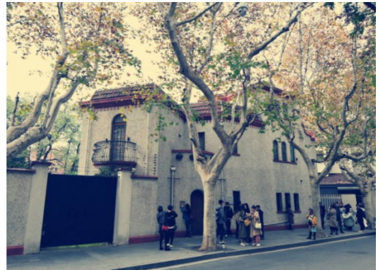
Fig 10. Wukang Road

George Bernard Shaw, a master of English literature, came to Wukang Road in 1933 and wrote a paragraph: Walking into Wukang Road, people who cannot write poetry want to write poems, people who cannot paint want to paint, and people who cannot sing. I want to sing, it feels wonderful. After 88 years, no matter what you can or cannot do, when you walk on Wukang Road, you will only want to take pictures, mark on social media, and eat ice cream. Wukang Road becomes the typical representation of net-red stores cluster. A business model different from traditional pedestrian streets and large shopping malls is incubating. A set of building scene connects and become a net celebrity community. The walls of living quarters, commercial areas, and tourist attractions are broken. The history, culture, aborigines and foreign traffic, information, and new media are colliding with each other. At the same time, the gravitational force generated by this collision has also brought many new contradictions and problems.