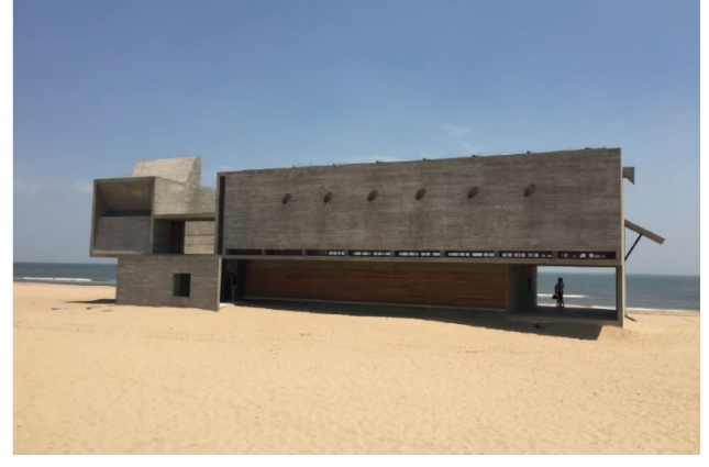
Fig 1. The library overview

One good example is the public seashore library created by SDX joint publishing company. The library is about 450 square meters, three stores. The big picture windows and step-type seats in the reading room enable people inside have an easy look to the sea. The building structure and the material use well fit the site atmosphere. Together they build an isolated feeling, which will be reinforced when you recall it functions as a library. The library is tagged as the most isolated library in the world on the internet. KOLs come first and post their pictures and reviews online. Then more and more visitors come to the place. The library is located far away from the city, not can be easily reached. Most visitors are not driving by the impulse to find a place to read, but driving by its name, desiring to get the experience of being in the most isolated place. From there, the building's look is more important than its function. In other words, the building design principle is not to serve a transitional need such as a good place to read in this example, but to create an overall attractive atmosphere - a scene for loneliness. The main purpose is to invite people to come to the place, what they do here and what the place can provide them to do things seems not that important.