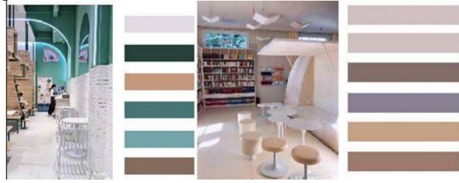
Fig 7. Color matches for typical celebrity shops

Because of the limited space, color choices are important for the whole design. Taking drinking stores for instance, the interior color uses is richer and bolder. One trend is to use colors that have sharp contract, while another one focus more on the color coordination. The visual impact generates different atmosphere: the combination of pink, yellow, and blue make people feels cute and young, while a more coordination color choices make the space more comfortable. The color choices set the whole keynote, then the furniture and decorations help the store to build the store line [7]. Usually, every wall sets as a story board, using light and decorations to rich the content; every furniture set a situation that full of imagination. For example, a small table is for one girl to set and read alone while a large table is for a group of friends to hang out there. To reinforce this kind of imagination, lights and small items takes a great credit [8].