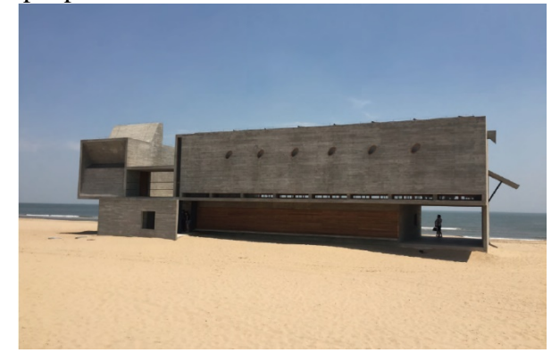
Fig 2. The north side

Sea, solitude, light and shadow, truth and mystery, these terms are the architectural image that impressed on viewers' mind. It creates a slow life utopia for city residents. To do so, the design well united the building, the nature, and the interior space to shape many building scenes. When you look towards the endless sandy beach and the sea horizon, the gray building will easily pop up, like a navigation mark. The building is organized simply by different sizes' boxes. The building uses the simplest language and material, wood, and concrete, to wave with the landscape. The large corridor and different sizes and shapes' French window not only invite natural light inside but also create a sharp sense of picture frame, enclosing people's view, and the sea. By using these specific design methods, architect presents people's romantic needs for this area.