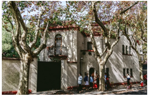
Fig 11. Wukang road

the transformation, Wukang Road has become a link of collective memories and an intersection of Internet celebrity. It is an outsider who makes Wukang Road a traffic destination in Shanghai and can compete with Nanjing Road and the Oriental Pearl Tower. In 2012, Frenchman Franck Pecol opened a bakery called Farine on Wukang Road. The refreshing French storefront, "imported flour", "handmade bread" and other fresh and attractive words, "opened a precedent for punching in Wukang Road. ".