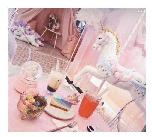
Fig 8. The chase of aesthetic sense seems lead to another excessive end

These net-red stores are good places to take photos. Benefits from the internet and social media, people will come to the store just derived by an image they saw online -- eager to be the person on it and get a similar picture. The trend of net-red stores further strengthens the important of space atmosphere of the building. Many online celebrity stores only pay attention to the superficial current traffic, and do not really clarify their own characteristics and customer groups. Most of them follow the trend. There are indeed many customers who like online celebrity stores. Therefore, restaurants, dessert coffee shops, and bookstores on the street have intentionally or unintentionally added too many online celebrity features. Some of them creates a somehow superficial feeling.