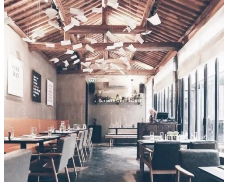
Fig 6. A typical celebrity shop design style

In recent years, net-red shops have long been nothing new, and there are always so many in every city. Or the decoration is ingenious, or the product is novel and unique, or there have been celebrities to go for consumption, attracting waves of netizens who are keen to chase trends. After arriving at the store, costumers will posture and pose for selfies, find the angle, and adjust the filter to take pictures after the dishes are on the table. It takes ten minutes to retouch the picture, accompanied by three or two soft texts to the social medias. Then, the costumer just sits and wait for the likes and comments. As for the taste of the dishes, it is no longer important. The design style and the scene it builds that will show directly on the pictures, on the other hand, becomes the most important thing.